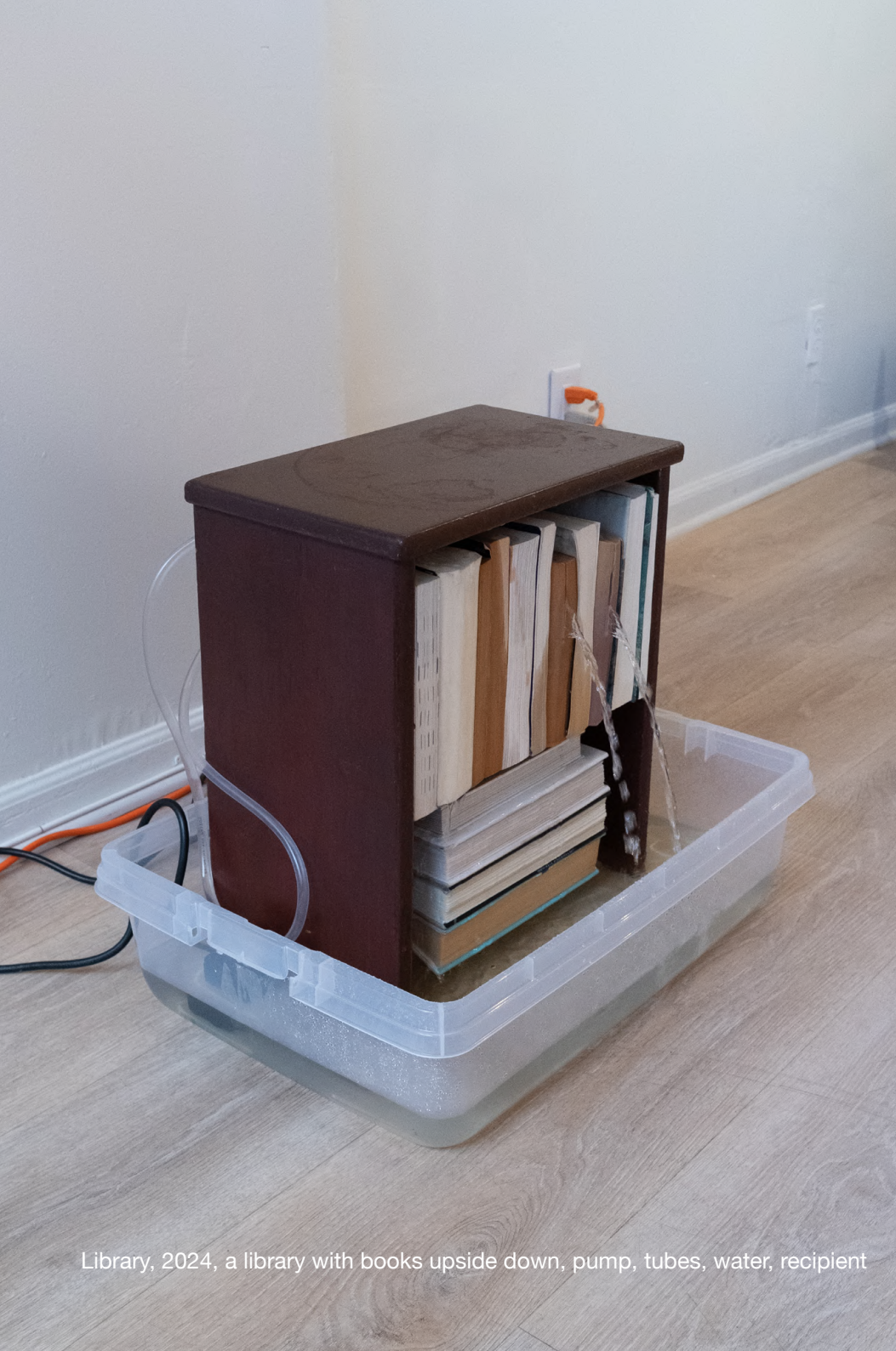
Library, 2024, a library with books upside down, pump, tubes, water, recipient