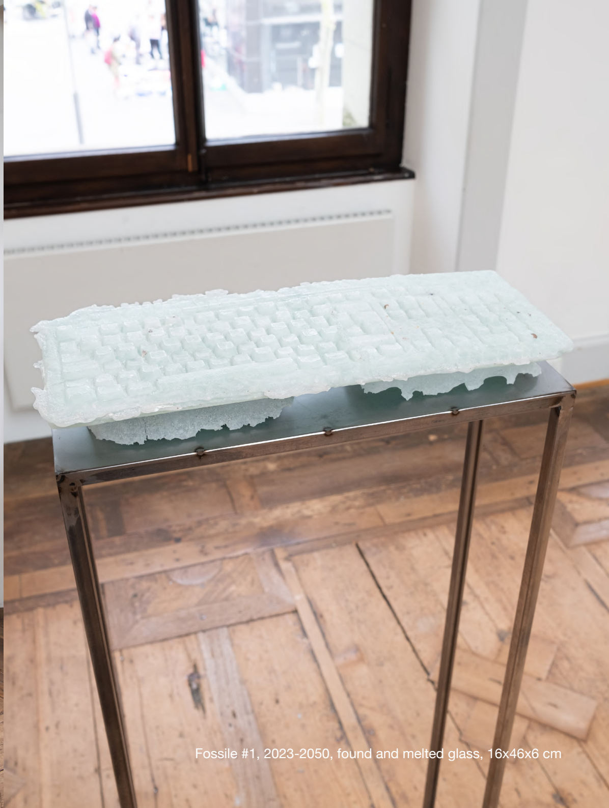
Fossile #1, 2023-2050, found and melted glass, 16x46x6 cm