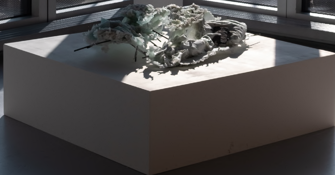
Doomscrolling, 2060, found and melted glass, ca. 100x120x40cm

Master Fine arts Final diploma exhibition (2025) Zürcher Hochschule der Künste (ZHdK), Zürich