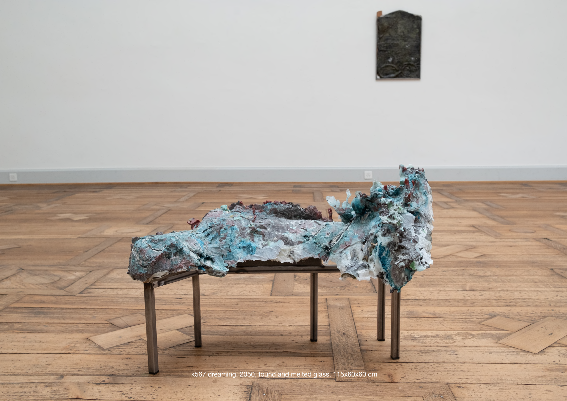
k567 dreaming, 2050, found and melted glass, 115x60x60 cm